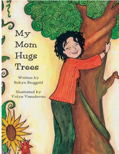
My Mom Hugs Trees

Do you think your Mom does strange things? Well, my Mom hugs trees, rescues bugs, sings with birds, and talks to flowers. Come meet my Mom. You might end up doing strange things too!